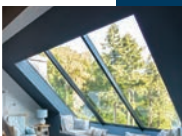
ROOFS & ROOFLIGHTS