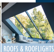
ROOFS & ROOFLIGHTS