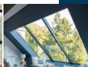
ROOFS & ROOFLIGHTS